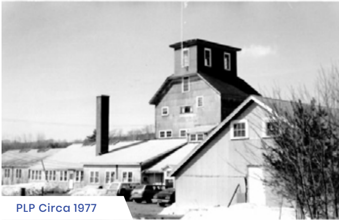
PLP Circa 1977